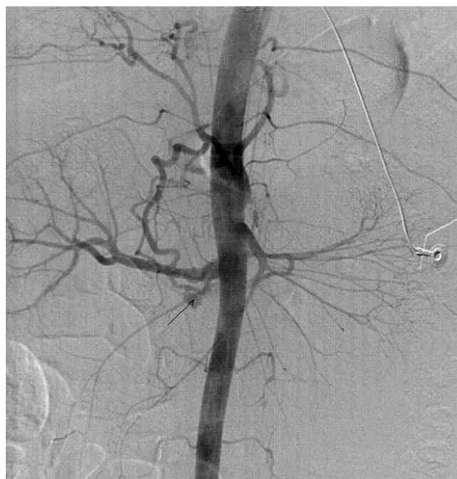
Figure 2 Digital subtraction angiogram showing contrast leak from the ruptured aneurysm.

These aneurysms can be managed surgically or by minimally invasive endovascular techniques with transcatheter embolization as done in this case or by a combination of both [5]. However, lately they have been successfully managed by thrombin injection [6,7] when tortuous anatomy makes embolization not feasible or using ethylene vinyl alcohol injection [8]. On extremely rare occasions they can thrombose on their own [9]. Surgical management is always challenging owing to the presence of multiple small pancreatic vessels that communicate with these aneurysms and may involve pancreatic resection. Mini-