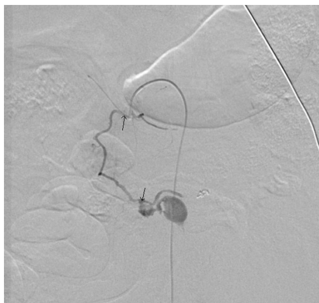
Figure 3 Coil embolization of feeding vessel through SMA.

minally invasive coil embolization is therefore an attractive option and should be the first line of management, however it should be borne in mind that because in elective