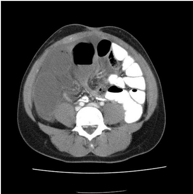
Figure 3 CT showing dilated proximal jejunum and a closed loop obstruction in the terminal ileum. There is a positive "swirl" sign consistent with a diagnosis of small bowel volvulus.

procedure include the development of cuff abscess, pouch leak, strictures, fistulation, stenosis, and pouchitis[16]. Small bowel obstruction as a complication of ileo-anal pouch formation has been described in the literature, and is usually a result of post-operative adhesions either within the pelvis, or at the site of the covering ileostomy[17-20]. The development of pouch ischaemia and