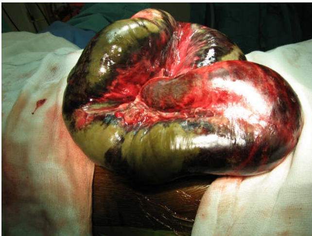
Figure 4 Intraoperative picture showing small bowel volvulus and necrotic bowel.

procedure include the development of cuff abscess, pouch leak, strictures, fistulation, stenosis, and pouchitis[16]. Small bowel obstruction as a complication of ileo-anal pouch formation has been described in the literature, and is usually a result of post-operative adhesions either within the pelvis, or at the site of the covering ileostomy[17-20]. The development of pouch ischaemia and