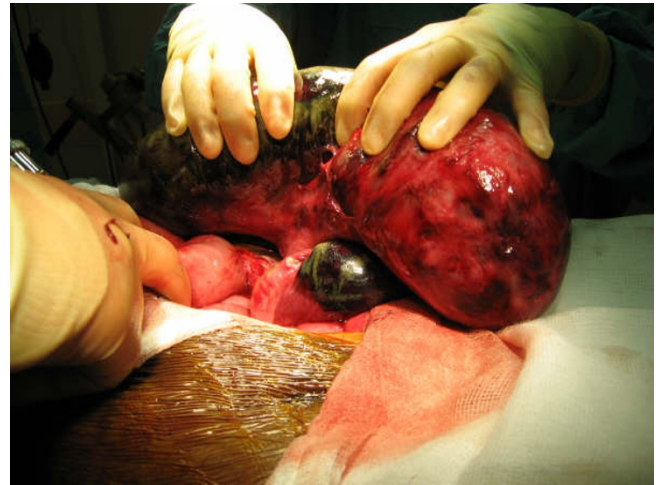
Figure 5 Intraoperative picture showing necrosis of ileo-anal pouch.

necrosis following small bowel volvulus however is a rare complication with only one reported case identified[10] with classical radiological 'corkscrew' findings as apparent in our case. This diagnosis should therefore be considered in patients presenting with small bowel obstruction following ileo-anal pouch procedures.