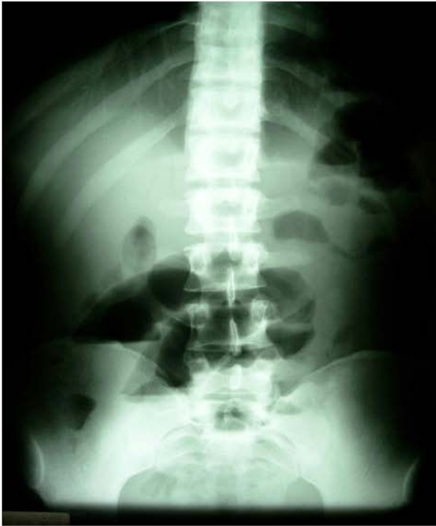
Figure 1 X-ray shows multiple loops of dilated small bowel with air- fluid levels.

cavity with dilated small bowel loops without injuries of the parenchymatous abdominal organs. Diagnosis of hemoperitoneum was made, but with stability of vital signs, little abdominal tenderness, no signs of evident small bowel obstruction, and normal value of blood cell count, the patient was admitted in the surgery department for observation. During his hospital course his abdomen remained a little distended, with mild lower quadrant pain that was well controlled with analgesic pain medications. A repeat white and red blood cell count remained normal. Two days later, however, the abdominal pain was increasing, the vomits had turned fecaloid, and with absolute constipation. An abdominal computed tomography (CT) was performed which showed a targetlike lesion in the left upper quadrant with dilated small bowel loops proximally, suggestive of an ileo-ileal intussusception (Fig. 2). Free fluid was seen in the paracolic gutters, pelvis and between bowel loops. There was no solid organ injury. Based to the clinical signs of small bowel obstruction and the result of CT, an emergent laparotomy was decided. At the exploration, the peritoneal cavity was filled with 500 cc of blood-stained serous fluid, while numerous dilated loops of small bowel were present. At approximately 90 cm from the ileo-cecal junction, there