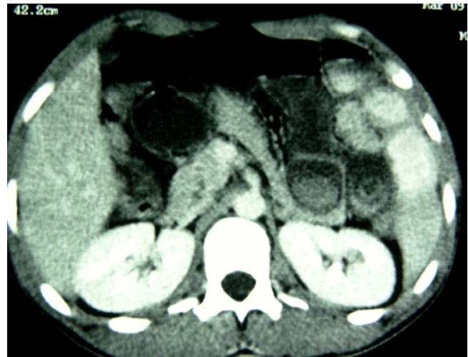
Figure 2 CT of the abdomen demonstrating classic target sign in the the left upper quadrant, pathognomonic for ileoileal intussusception.

cavity with dilated small bowel loops without injuries of the parenchymatous abdominal organs. Diagnosis of hemoperitoneum was made, but with stability of vital signs, little abdominal tenderness, no signs of evident small bowel obstruction, and normal value of blood cell count, the patient was admitted in the surgery department for observation. During his hospital course his abdomen remained a little distended, with mild lower quadrant pain that was well controlled with analgesic pain medications. A repeat white and red blood cell count remained normal. Two days later, however, the abdominal pain was increasing, the vomits had turned fecaloid, and with absolute constipation. An abdominal computed tomography (CT) was performed which showed a targetlike lesion in the left upper quadrant with dilated small bowel loops proximally, suggestive of an ileo-ileal intussusception (Fig. 2). Free fluid was seen in the paracolic gutters, pelvis and between bowel loops. There was no solid organ injury. Based to the clinical signs of small bowel obstruction and the result of CT, an emergent laparotomy was decided. At the exploration, the peritoneal cavity was filled with 500 cc of blood-stained serous fluid, while numerous dilated loops of small bowel were present. At approximately 90 cm from the ileo-cecal junction, there