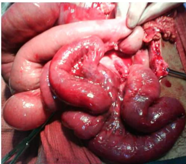
Figure 1 On table picture showing dilated proximal intestinal loops and a part of Ischemic ileum. Note the clear line of demarcation between healthy and involved ileum.

Abdomen was opened with a midline vertical incision. Three litres of hemorrhagic fluid was drained. Dilated jejunal loops were seen. These loops were traced up to a segment of ischemic ileum. The ileal segment was strangulated by a band composed of inflamed appendix and omentum (Fig 1 & 2). The band was running from caecum