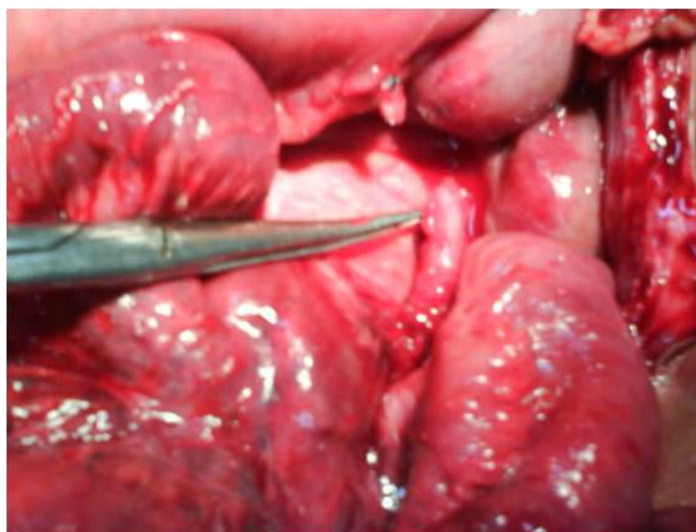
Figure 2 Higher magnification picture showing the band which had produced strangulation. This band composed predominantly of appendix and in part by omentum (not shown in this picture). Note the area of attachment of the band on distal ileum.

to ileum producing a window underneath. Through this window the intestine had protruded (Fig 3).