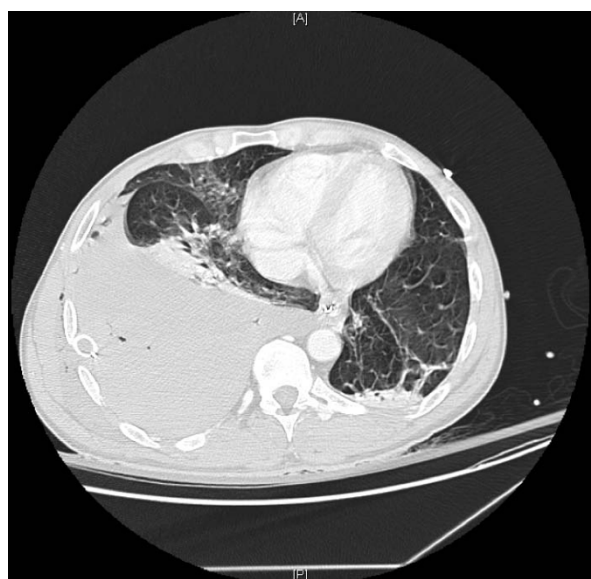
Figure 1 CTA of chest revealing large residual clot in the right hemi-thorax. This study was performed in an attempt to localize the bleeding source in our patient. The study was negative in terms of identifying an anatomic source of bleeding (most relevant with respect to examination of the great vessels in the thoracic outlet, albeit falsely negative). However, this study served as a proxy for the post-thoracostomy chest x-ray and identified the insufficient drainage of the right chest with the thoracostomy tube in place.

CT, a residual clot occupying the > 50% of the right chest was appreciated (see Figure 1). There was no evidence of intra-abdominal injury on the CT scan of the abdomen. A second thoracostomy tube was placed and approximately 2.2 L of blood were evacuated with suction. Given that this output now met criteria for surgical exploration, the decision was made to take the patient to the operating room for an exploratory thoracotomy (PAT + 60 min). Resuscitation up to this point consisted of 4 L of crystalloid and 6 units of PRBCs.