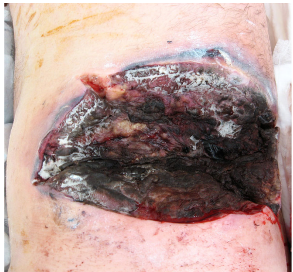
Figure 3 Surgical wound of the patient's left flank showing necrotizing soft tissue infection covered by white patches of fungi.

H1N1 influenza in pregnancy has been discussed in the literature before [12-15]. The patient described in the second case report had a remarkable past history for having a total gastro-esophagectomy and colonic interposition due to caustic injury 8 years ago. She had one vaginal delivery 6 years ago, and had a relatively normal