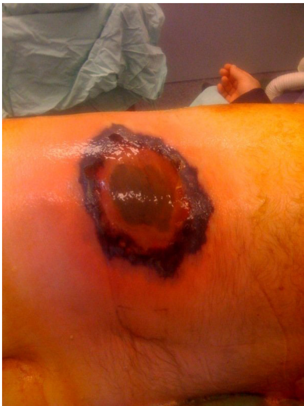
Figure 2 The lesion on the patient's left flank before the first operation.

extensive debridements of his left flank (figure 3) and subsequently an extensive debridement of both his thighs and left arm due to disseminated Mucormycosis infection. The patient expired 4 days after his admission due to septic shock and MOF.