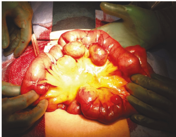
Figure 1 Jejunal diverticula. Intraoperative photograph demonstrating multiple jejunal diverticula. Note that the diverticula arise at the mesenteric border.

186 x10 9 /L, and C-reactive protein <5 mg/L. The bleeding appeared to have ceased and the patient was considered haemodynamically stable. She had no more episodes of rectal bleeding during the night or the next morning and was discharged with an urgent appointment for outpatient workup with colonoscopy.