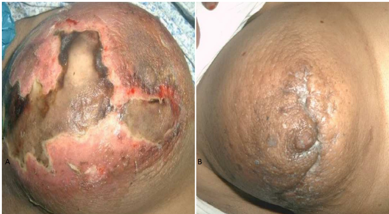
Figure 4 (A) Gangrene of breast in diabetic female which progressed to necrotizing fasciitis; (B) Breast after control of blood sugar and serial debridements.

4A). Non diabetic elderly female having idiopathic breast gangrene had gangrene after 48 hours of mastitis (Figure 5A). All had skin and subcutaneous gangrene. Size of lesion varied from small localized gangrene patch to