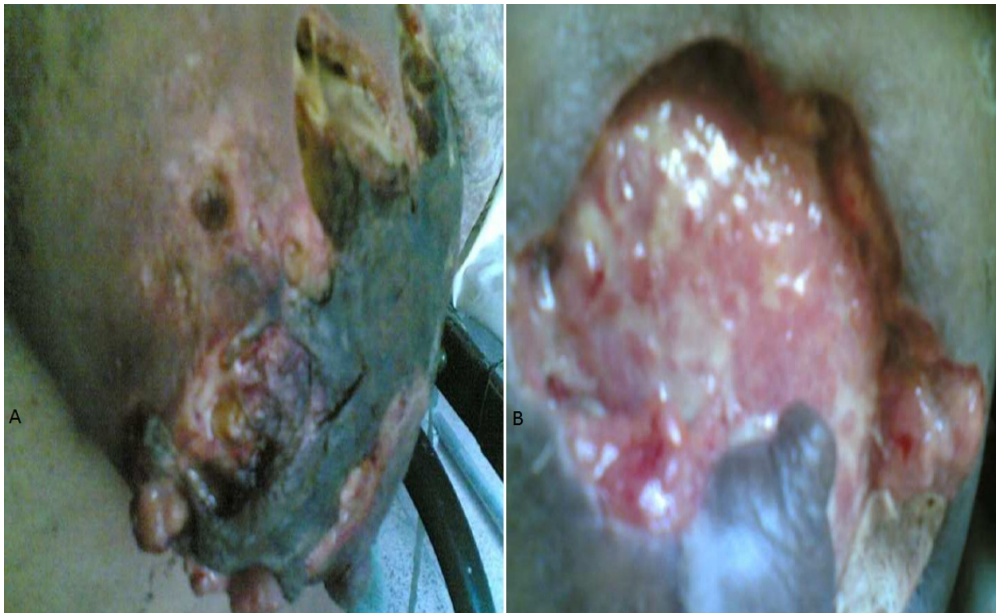
Figure 3 (A) Gangrene in a breast after she had needle aspiration for confirmation of pus and progressed to necrotizing fasciitis in a lactating female; (B) Breast after serial debridements.

gangrene varied from 48 hours to 96 hours. (Figure 1A) Diabetic patient who had breast gangrene had no history of application of any topical agent, gangrene appeared 120 hours after appearance of breast abscess (Figure