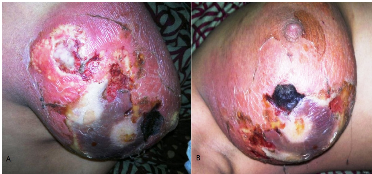
Figure 2 (A) Gangrene of breast following tooth bite in a lactating female; (B) Typical gangrene patch on breast following tooth bite by infant in lactating female.

Four patients had local application of a belladonna paste on a mastitis area of the breast had time interval from application of a topical agent to appearance of