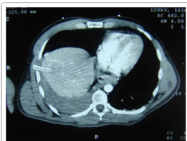
Figure 2 CT scan of the patient where hepatothorax is displayed with the drain inside.

Classically, there has been a predominance of lesions of the left hemidiaphragm, with a ratio of 25:1. However, most modern series balance this data and show that right hemidiaphragm injuries can represent almost 35% of all diaphragm injuries [9]. This pattern may explain why the liver develops a protective cushioning pressure, although some authors believe that right hemidiaphragm injuries are associated with increased