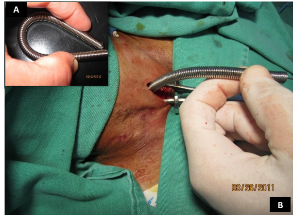
Figure 6 The spherical tip flexible introducer. Insert (A) depicts the elastic property of the introducer constructed with a circular helical spring. Picture (B) shows the flexible introducer positioned in the trachea facilitated by the self-retaining retractor.

During the study period, 100 patients underwent percutaneous tracheostomy by the modified technique described in this study. All percutaneous tracheostomies were performed on intubated patients at the bedside. Ninety patients (90%) underwent the procedure in the ICU. The remaining 10 patients were in another hospital location: 4 patients were in the hospital step-down unit, 3 in the trauma room, and 3 in the post-anesthesia