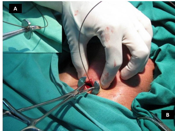
Figure 5 The self-retaining retractor. Insert (A) depicts how the self-retaining retractor is passed over the guidewire in locked position. Picture (B) shows how the retractor enables hands free lateral retraction of the pre-tracheal soft tissue, and the aperture on the anterior tracheal wall. The limiter ridge prevents insertion of the retractor too far into the trachea.

CA). Data are reported as the mean \pm SEM and percentages.