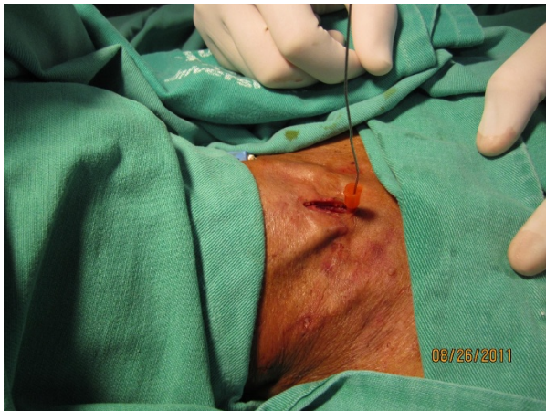
Figure 3 The guidewire in position. The guidewire is passed into the tracheal lumen through the 14 G intravenous catheter.

tracheal orifice open (Figure 5). A flexible, spherical tip introducer (6 mm internal diameter) is inserted into the airway under direct vision, facilitated by the retractor which is removed afterwards (Figure 6). A tracheostomy tube is placed inside the trachea passing over the guidewire and the flexible introducer (Figure 7). At this point the flexible introducer and the guidewire are removed, the cuff is inflated, and the patient is ventilated via the tracheostomy tube. The endotracheal tube is completely removed after adequate ventilation is confirmed by end-expiratory volume on the ventilator and auscultation of the patient. The tracheostomy cannula is secured in place with a neckband, and a chest radiograph is performed. Statistical analysis was performed using Graph Pad Prism (GraphPad Prism Software, Inc., San Diego,