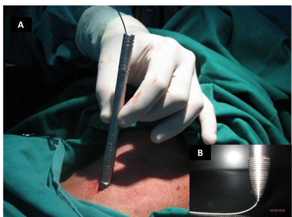
Figure 4 The threaded tip dilator. Picture (A) shows the threaded tip dilator in the incision. Insert (B) depicts how the guidewire, passing through the tip of the threaded dilator, prevents the threads from "catching" other structures.

tracheal orifice open (Figure 5). A flexible, spherical tip introducer (6 mm internal diameter) is inserted into the airway under direct vision, facilitated by the retractor which is removed afterwards (Figure 6). A tracheostomy tube is placed inside the trachea passing over the guidewire and the flexible introducer (Figure 7). At this point the flexible introducer and the guidewire are removed, the cuff is inflated, and the patient is ventilated via the tracheostomy tube. The endotracheal tube is completely removed after adequate ventilation is confirmed by end-expiratory volume on the ventilator and auscultation of the patient. The tracheostomy cannula is secured in place with a neckband, and a chest radiograph is performed. Statistical analysis was performed using Graph Pad Prism (GraphPad Prism Software, Inc., San Diego,