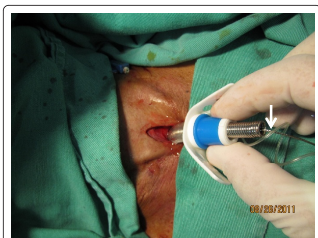
Figure 7 Insertion of the tracheostomy tube in the trachea. Picture shows the insertion of the tracheostomy tube in the trachea over the spherical tip flexible introducer. Arrow depicts the guidewire inside the introducer.

recovery room. Demographic data showed that the majority of the patients were men (68%) with a mean age of 49 \pm 2.2 years. The mean BMI of the patients was 25.6 \pm 2.1 , and the thyromental distance was 6.2 \pm 0.3 cm. The pretracheal tissue thickness was 1.5 \pm 0.7 cm. Twenty five percent of the percutaneous tracheostomies were performed on trauma patients, and 18% on acute care surgery non-trauma patients. The remaining patients were admitted to the hospital because of clinical (29%) or neurologic (28%) related diseases. The most common indication for percutaneous tracheostomy (95 patients) was the need for prolonged ventilatory support, with a mean intubation period of 9.5 \pm 4.2 days. Five patients underwent the procedure because of severe maxillofacial trauma. Percutaneous tracheostomy procedure time was 5.1 \pm 0.3 minutes, assessed from the time of skin incision to the time of placement of the tracheostomy tube inside the airway. A tracheostomy tube size 9.0 mm (internal diameter) was used in 70 patients (70%), a size 8.5 mm (internal diameter) was used in 20 patients, and a tube size 8.0 mm in the remaining patients.