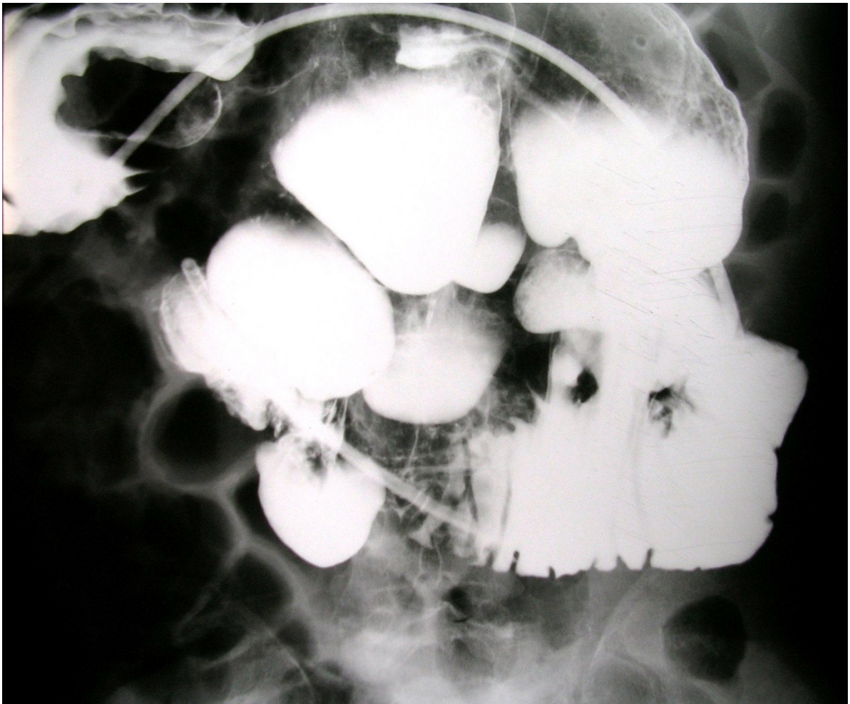
Figure 2 Enteroclysis showing multiple and dilated jejunal diverticula.

plexus in order to explain intestinal dyskinesia. Kongara et al. [4] performed manometric studies of the small bowel and described functional abnormalities in patient with small bowel diverticula. These facts support the hypothesis that irregular intestinal contractions generate increased segmental intraluminal pressure, favoring the diverticula formation through the weakest point of the bowel. A connection between intestinal diverticulosis and rare neuromuscular disorders such as Cronkhite-Canada syndrome [5], Fabry's disease [6] and mitochondrial neurogastrointestinal encephalomyopathy [7] has been described. Diffuse gastrointestinal giant diverticulosis with perforation and malabsorption associated with giant jejunal diverticula in Ehlers-Danlos syndrome have also been reported [8,9]. Progressive systemic sclerosis often involves the gastrointestinal tract and constitutes a characteristic example of proven dysmotility and acquired origin of the jejunoileal diverticulosis. Manometric