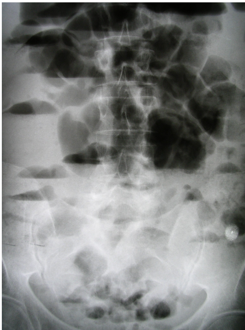
Figure 1 X-ray abdominal film on admission, showing distended small bowel loops and gas-fluid levels.

end-to-end anastomosis were carried out. A cholecystectomy was also performed.