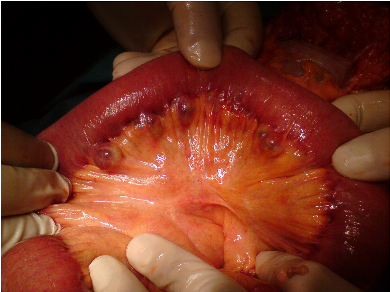
Figure 5 Multiple ileal diverticula were incidentally discovered during exploratory laparotomy for intestinal bleeding. Diverticula were not resected.

Mechanical obstruction can be caused by adhesions or stenosis due to diverticulitis, intussusception at the site of the diverticulum and volvulus of the segment containing the diverticula. In addition, sizable stones enclosed in the diverticula may apply pressure to the adjacent bowel wall or may escape from the diverticulum causing intestinal occlusion. Pseudo-obstruction, reported in 10-25% of cases, is usually associated with jejunal diverticulosis as a result of peritonitis (following diverticulitis), perforation, strangulation and incarceration of an enterolith within a diverticulum or related to the bacterial overgrowth and the visceral myopathy or neuropathy [44]. A wide, overloaded with liquid diverticulum may function as a pivot causing volvulus [40,45]. The formation of the enterolith may be de novo or around fruit seeds and vegetable material. The stone originates from biliar salts that deconjugated from the bacterial overgrowth within the diverticulum precipitate because of the more acidic pH of the jejunum [46].