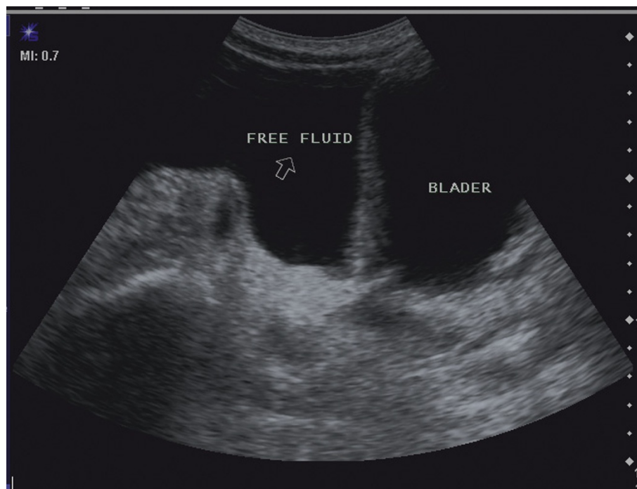
Figure 2 Ultrasonogram revealed free fluid in the paracolic gutter (right) and perisplenic (left).

Those with negative clinical signs and negative FAST are not followed by any other diagnostic methods. But in those patients with negative FAST and constant abdominal pain and stable hemodynamic due to shortage of intravenous contrast material in our center they have to undergo repeated FAST after 12 to 24 hours.