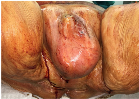
Fig. 1 Classic clinical presentation of Fournier's gangrene with scrotal/perineal swelling, tenderness on palpation, and poorly demarcated erythema, yet no visible necrosis of the skin

signs of soft tissue infections of the scrotum, perineum, and/or perianal areas (Fig. 1). Additionally, gangrenous or necrotic tissue and skin areas may be visible. Leukocyte and C-reactive protein levels are usually elevated. Imaging can be helpful if the diagnosis is uncertain. Early diagnosis is essential for the outcome, yet diagnosis is often delayed in this relatively rare disease, which in turn results in a delayed treatment start [9]. Optimal multimodal treatment consists of hemodynamic stabilization and supportive intensive care if necessary, broad spectrum antibiotic therapy, and extensive surgical debridement of the necrotic tissue [9]. Modern reconstructive techniques, such as skin grafting and flaps, provide reliable coverage of significant tissue defects and acceptable cosmetic results [10]. Despite the advancements in health care over the last decades, the mortality rates of FG still range between 3 and 67% even in developed countries [3]. Several risk scores, like Fournier's Gangrene Severity Index (FGSI), the Laboratory Risk Indicator for Necrotizing Fasciitis (LRINEC), and the neutrophil-lymphocyte ratio (NLR), have been developed to predict survival and prognosis in FG [11]. To the best of our knowledge, we are the first to report our experiences in treatment of FG in a Swiss tertiary care center and to assess the capability of three different scoring systems (FGSI, LRINEC, and NLR) to predict not only mortality, but also morbidity.